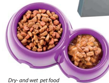
Dry- and wet pet food