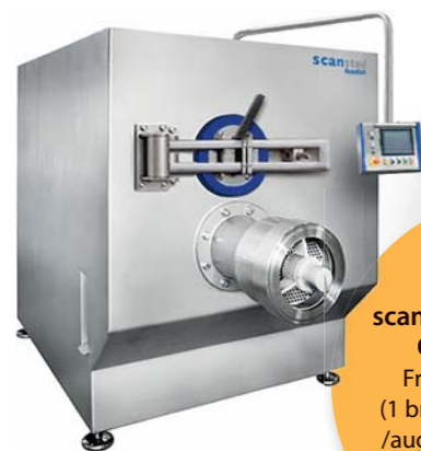
scansteel CombiGrinder CG 300 Wolfman Fresh-/Frozen Grinder (1 breaking/feeding worm /auger + 1 grinding worm /auger)