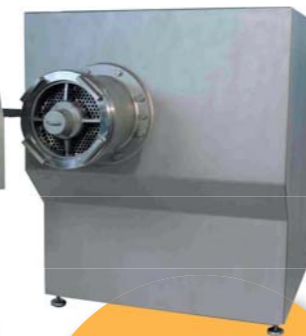
scansteel MG 400 Wolfman Fresh-/Frozen Grinder (single grinding worm/auger)

Complete range of heavy-duty Grinder series for the pet food industry