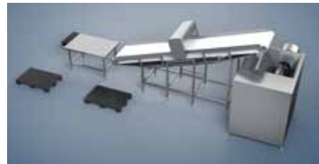
For feeding of frozen blocks: optional inclined belt conveyor w/metal detector

scansteel foodtech supplies the World's largest grinder programme for high quality and high volume grinding. The MG 550 Wolfman with its Ø550 mm knife set grinds frozen blocks, frozen or fresh pork skin, as well as all kinds of fresh meat raw material.